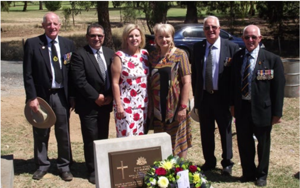
"It is wonderful that my son is remembered so many years after he died."