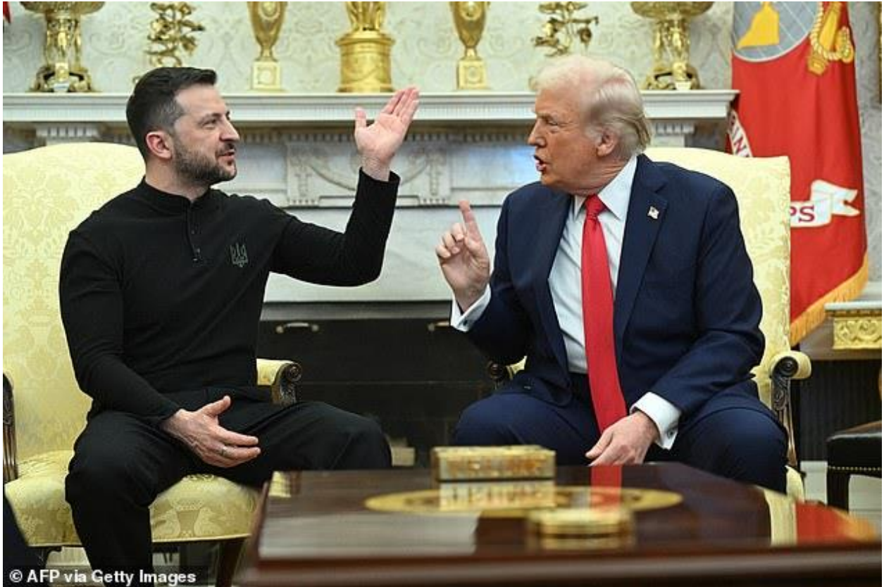
Relations between Mr Zelensky and Mr Trump reached new lows on Friday with a public slanging match in the Oval Office