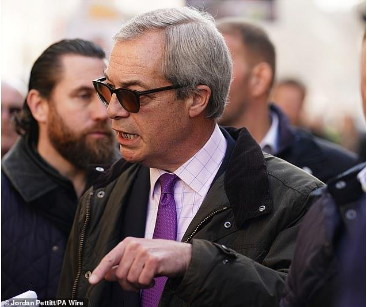
Reform UK leader Nigel Farage, who attended a farmers' protest in Westminster today, said Mr Vance was 'wrong, wrong, wrong, wrong'