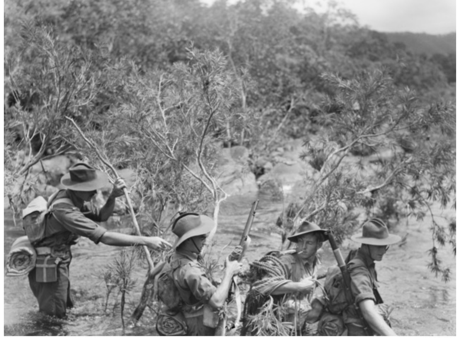
AUSTRALIAN WAR MEMORIAL 065482