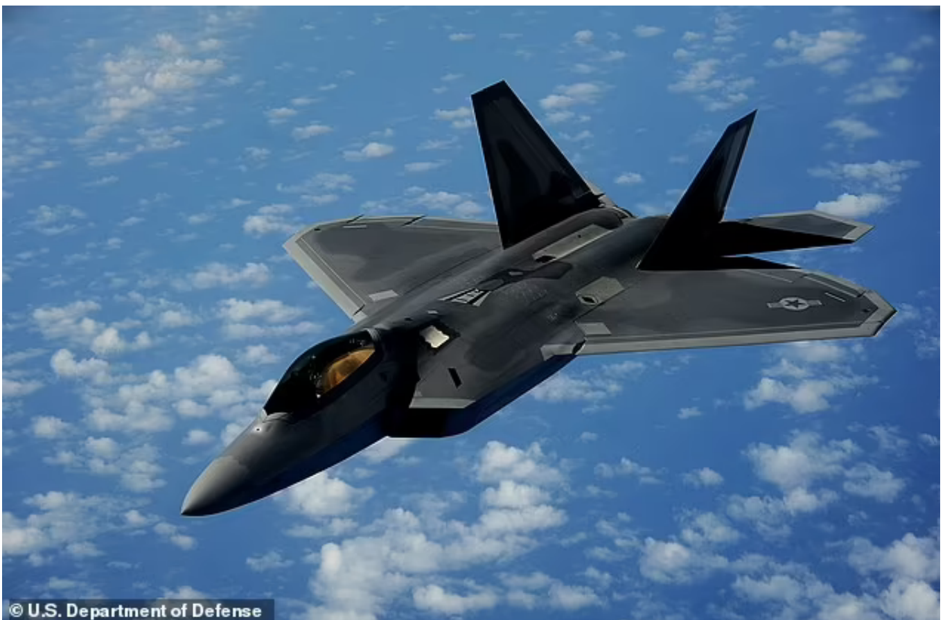
The military scrambled jets to investigate the balloon