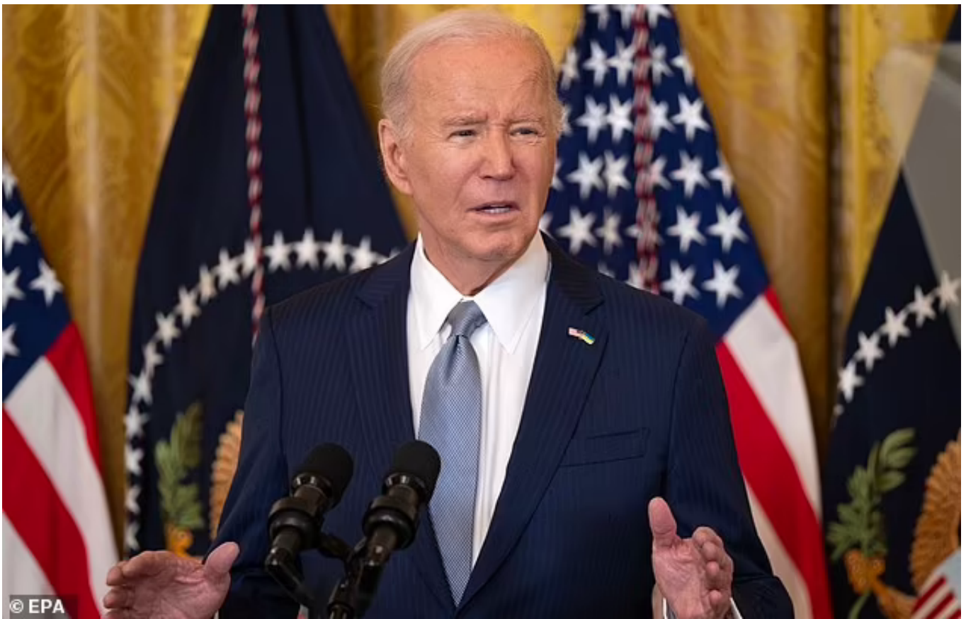
President Biden faced a diplomatic crisis when a Chinese spy balloon traversed the country last year