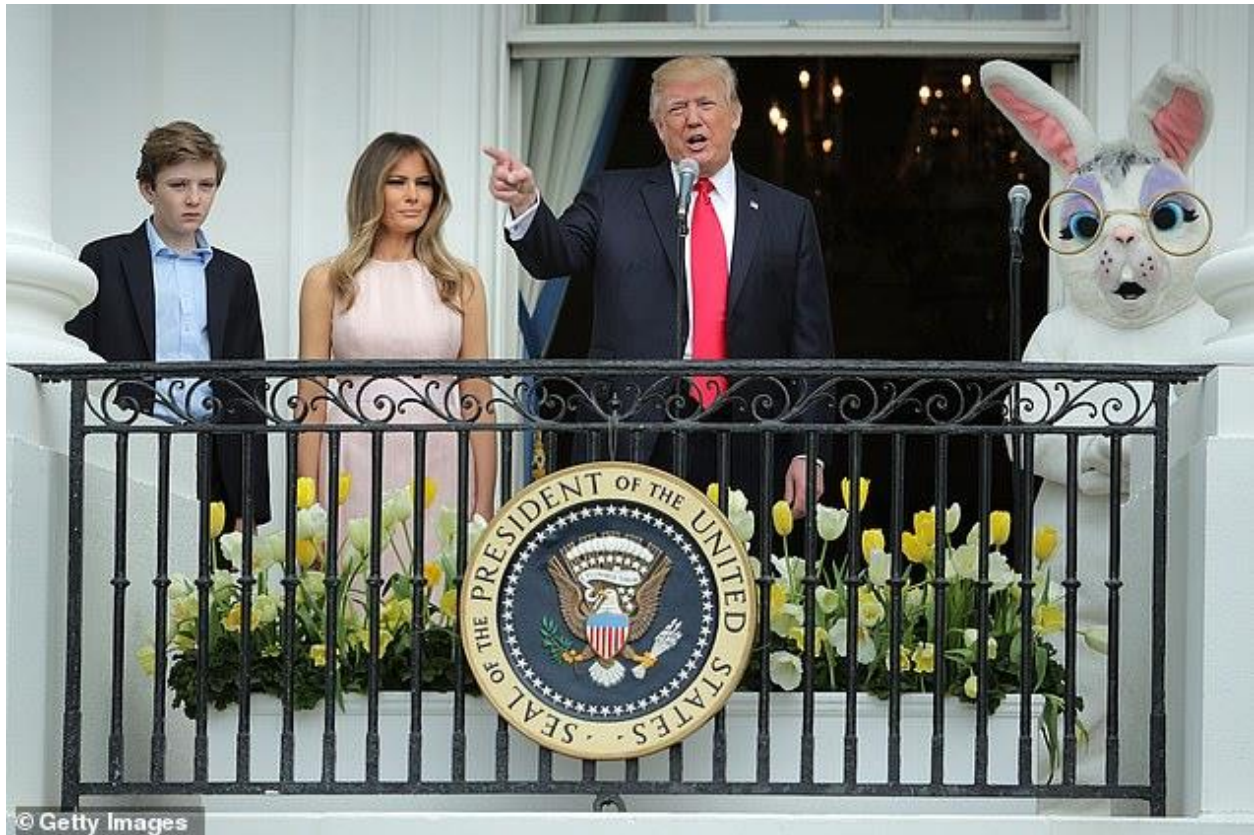
Former President Donald Trump delivers remarks from the Truman Balcony ahead of the 139th Easter Egg Roll event at the White House in 2017