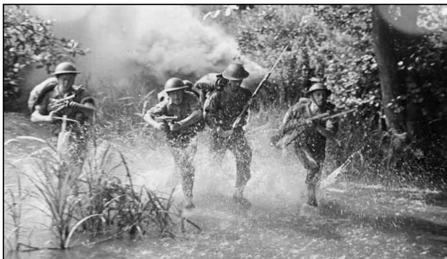
Library and Archives Canada PA 132456

Battle drill was a method of teaching minor infantry tactics and fieldcraft that emphasized fire and movement and was directly aimed at section, platoon and company leaders. It was a flexible type of training where soldiers rehearsed situations encountered on the battlefield. The acquisition of a tactical instinct was the fundamental objective of battle drill so that junior officers and NCOs were able to adapt to circumstances faced in real combat. As such, battle drill broke down manoeuvres into a series of basic movements – a very important aspect that made it different from other training methods. In practice, the objectives of battle drill were to enhance the physical capabilities of individual soldiers; to show them