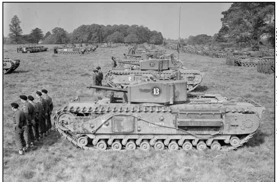
Library and Archives Canada PA 116274

more theoretical training where men became familiar with the concepts related to amphibious operations while including progressively practical exercises. In the case of the FMR, emphasis during this period was placed on landing and embarkation exercises, demolition and heavy explosives, and village fighting in addition with battle drill. Like other units of Simmer Force – 2nd Division's name for this operation – special attention was paid to physical fitness, the aim being the ability to walk nearly 18 kilometres in full assault kit in 120 minutes. However, on 28 May, the training