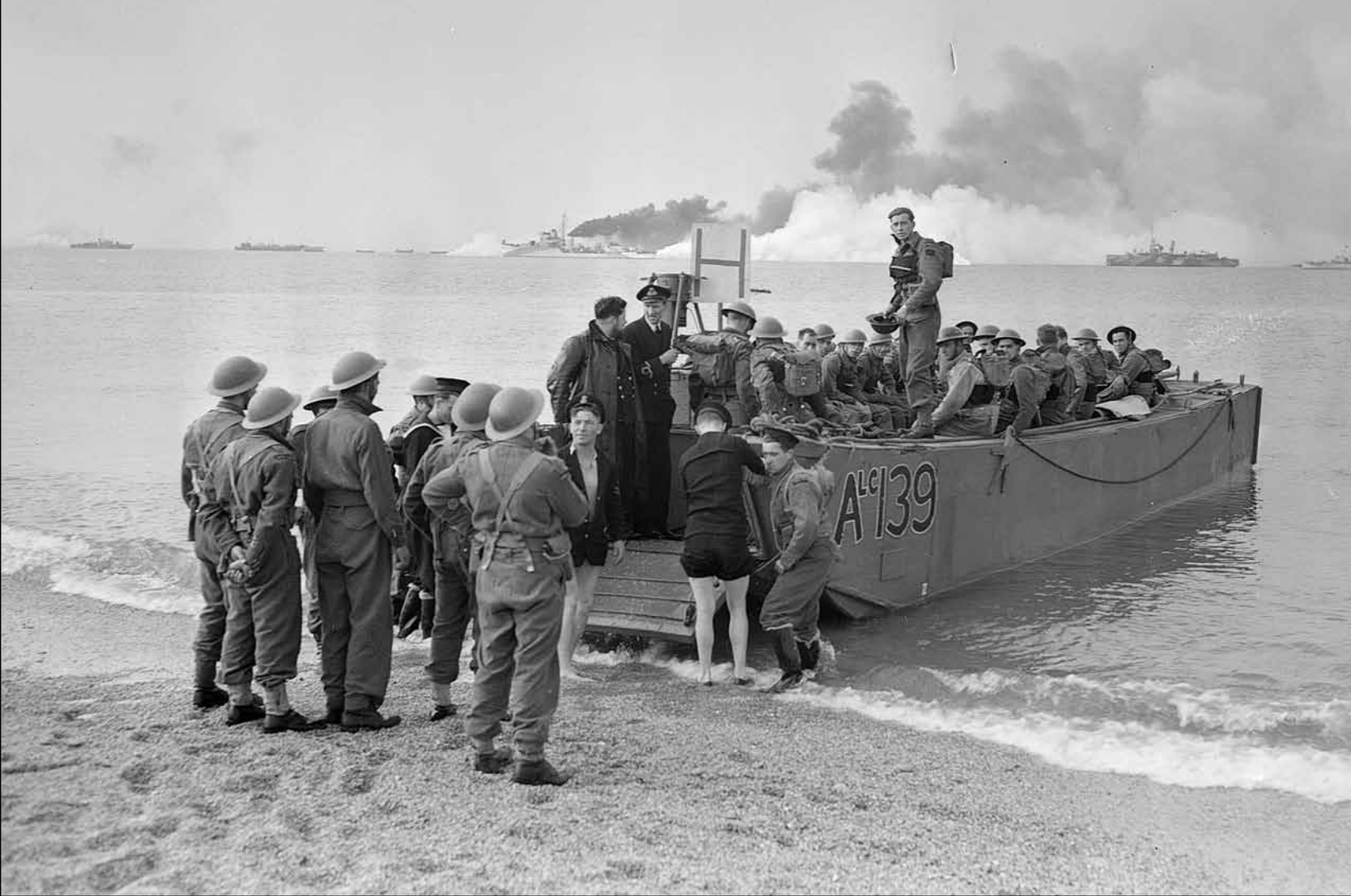
Canadian troops practice assault landings, July 1942.

another unit. Indeed, the FMR were ordered during Operation Jubilee to disembark and support the attack of the Essex Scottish Regiment at Red Beach near the tobacco factory. This role involved flexibility, initiative, and instinct by junior leaders to avoid the beach becoming a killing zone under enemy fire. However, this was never practiced during the Yukon exercises. 67