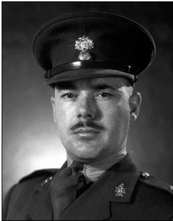
Canadian Forces photo ZK-28

Six FMR officers attended battle drill courses from November 1941 to May 1942 and the unit began battle drill training from January 1942 onward. This new type of training worked well and was received positively by men as additional officers returned from battle drill courses to share what they had learned. 48 The unit war diarist noted at the beginning of March 1942 that "More and more, a greater number of officers are sent on these courses (Battle Drill) from where they come back with new and better ideas from which the Unit will greatly improve. It is hoped that this Battalion will shortly arrive to a very high standard of training." 49 The introduction of battle drill allowed the dissemination of a common understanding of the doctrine at lower command levels. For the men and officers of the FMR, it was a welcome change to the dull training regimen that had been in effect since 1939. Moreover,