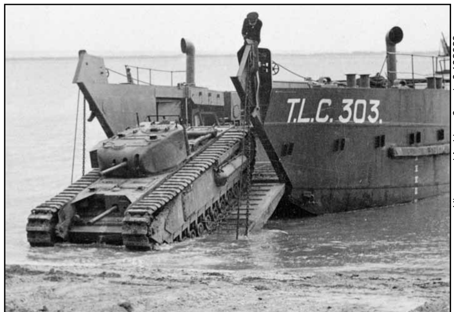
Library and Archives Canada C-138689

Though tanks played an important role in Operation Jubilee, little combined arms training took place before the raid.