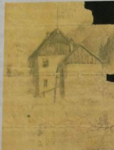
Drawing of house with flag on roof. Found on same paper as drawings of military objects. Name on back Read. Could this be a home or building he knew well???