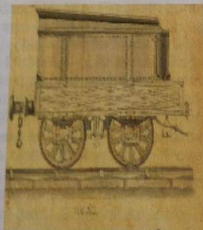
Military cart probably made in classes at Annapolis