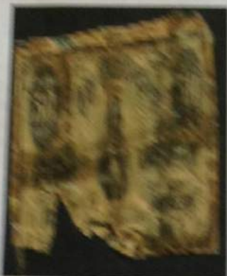
Confederate Money found with Read family papers