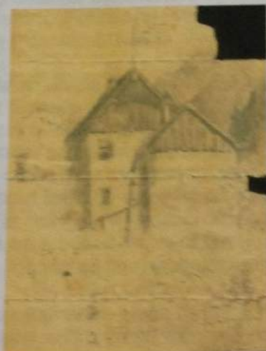
Drawing of house with flag on roof. Found on same paper as drawings of military objects. Name on back Read. Could this be a home or building he knew well???