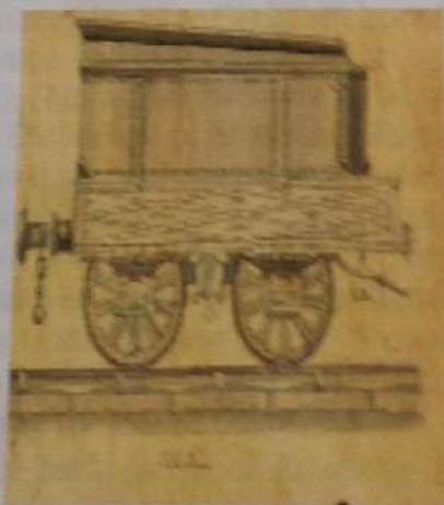
Military cart probably made in classes at Annapolis