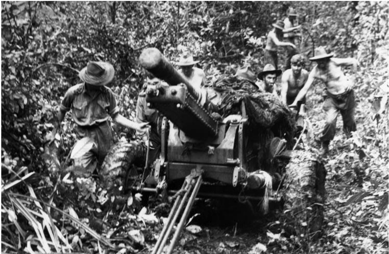
Members of an Australian artillery unit manhandle a 25-pounder gun through jungle foliage near Uberi on the Kokoda Trail in September 1942.

Meanwhile, Japanese troops occupied Ioribaiwa, elated to see the lights of Port Moresby in the distance. The hungry, long-suffering troops considered the sight as nearly tantamount to success. If they could capture Port Moresby, they would be able to eat and drink their fill from captured rations and celebrate the victory they had fought so hard to achieve. More than 1,000 Japanese soldiers had died by that point, and another 3,000 were wounded and sick. This left approximately 1,500 remaining.