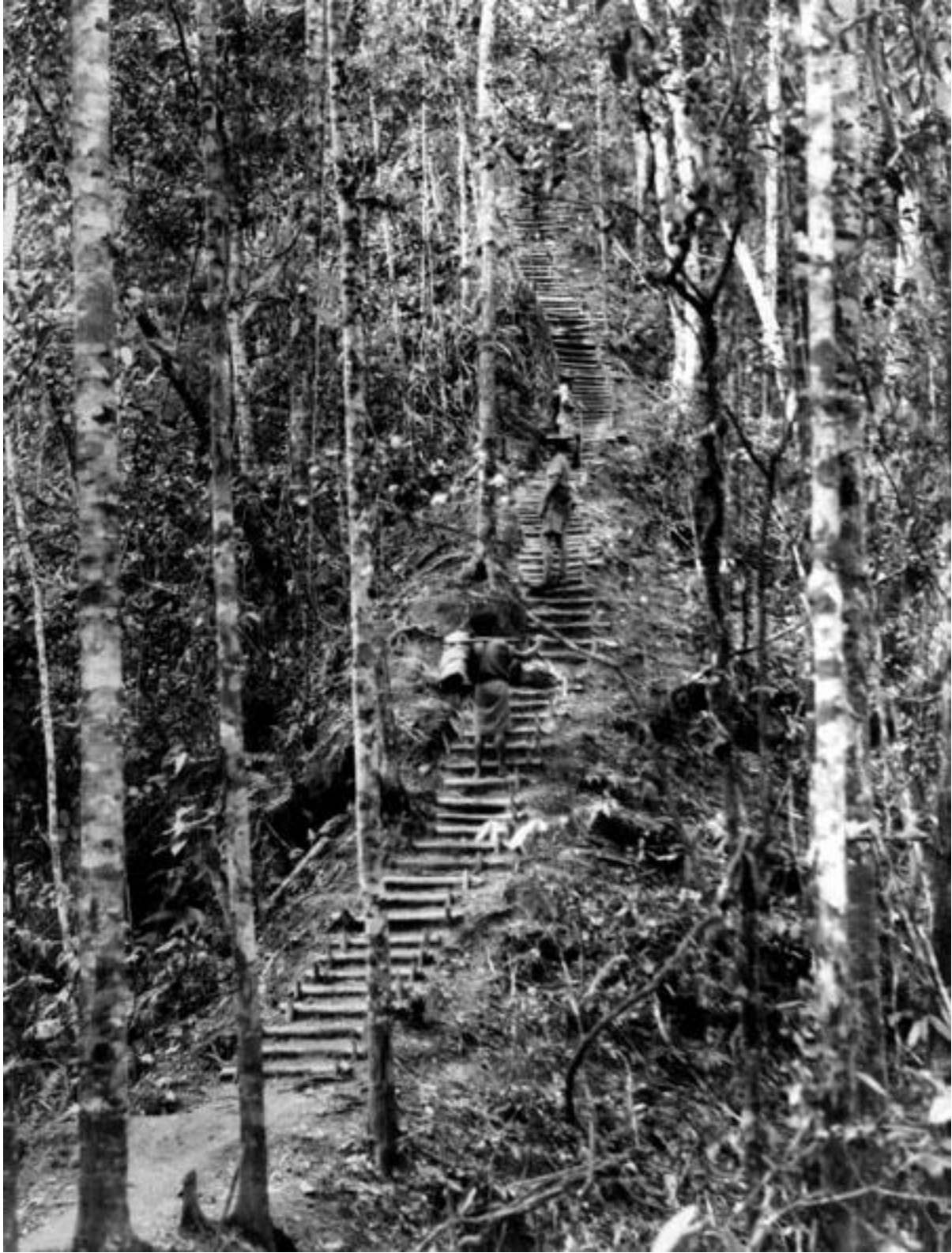
Native tribesmen transport gear up the 2,000 timber steps of the so-called Golden Stairs that traverse the Imita Ridge 25 miles north of Port Moresby. Native carriers brought forward food and ammunition and took the wounded to the rear.