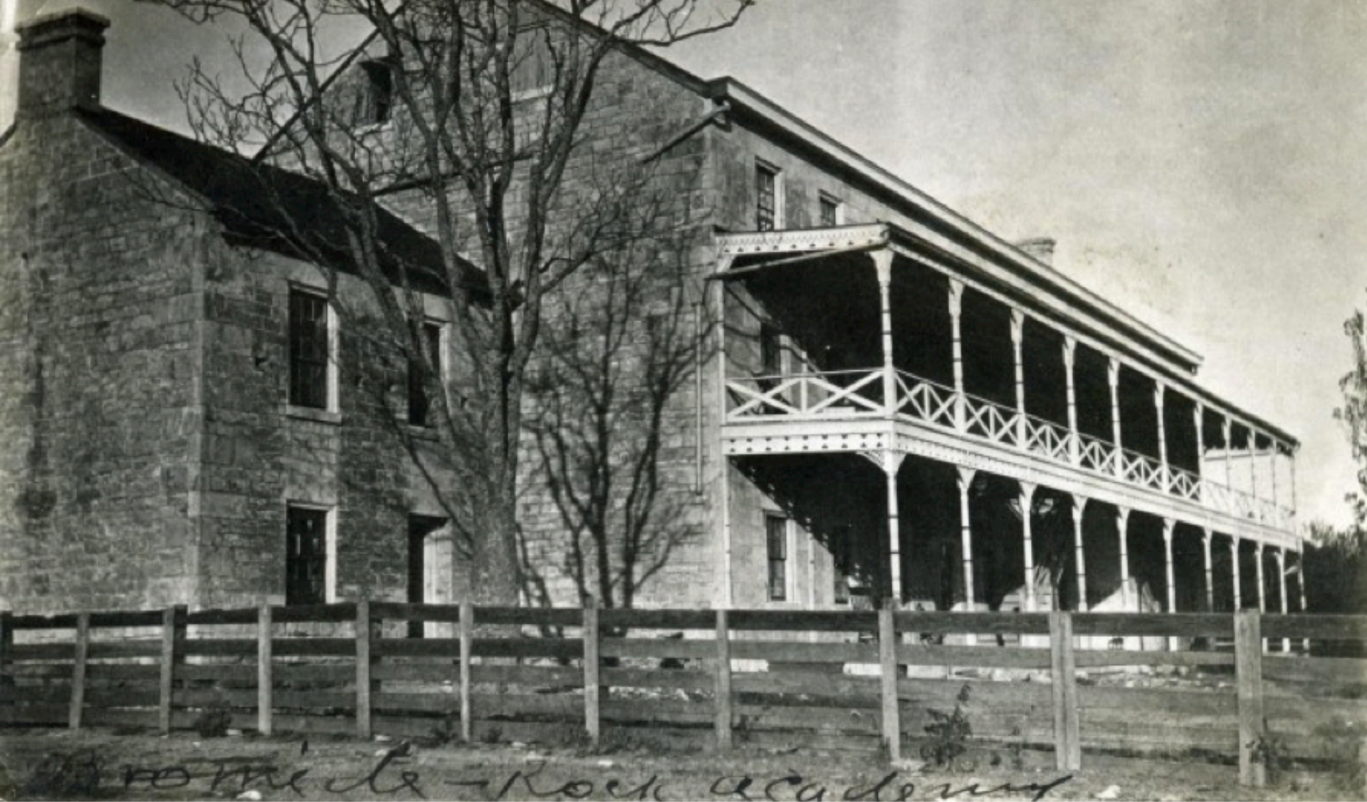
Another photo discovered of Wapanucka Academy labeled: “Photograph of the Wapanucka Female Manual Labour School, which was later called the Wapanucka Institute. The building, built one level at a time in 1852, was also known as the Chickasaw Rock Academy, and was located south of Bromide, Oklahoma.”