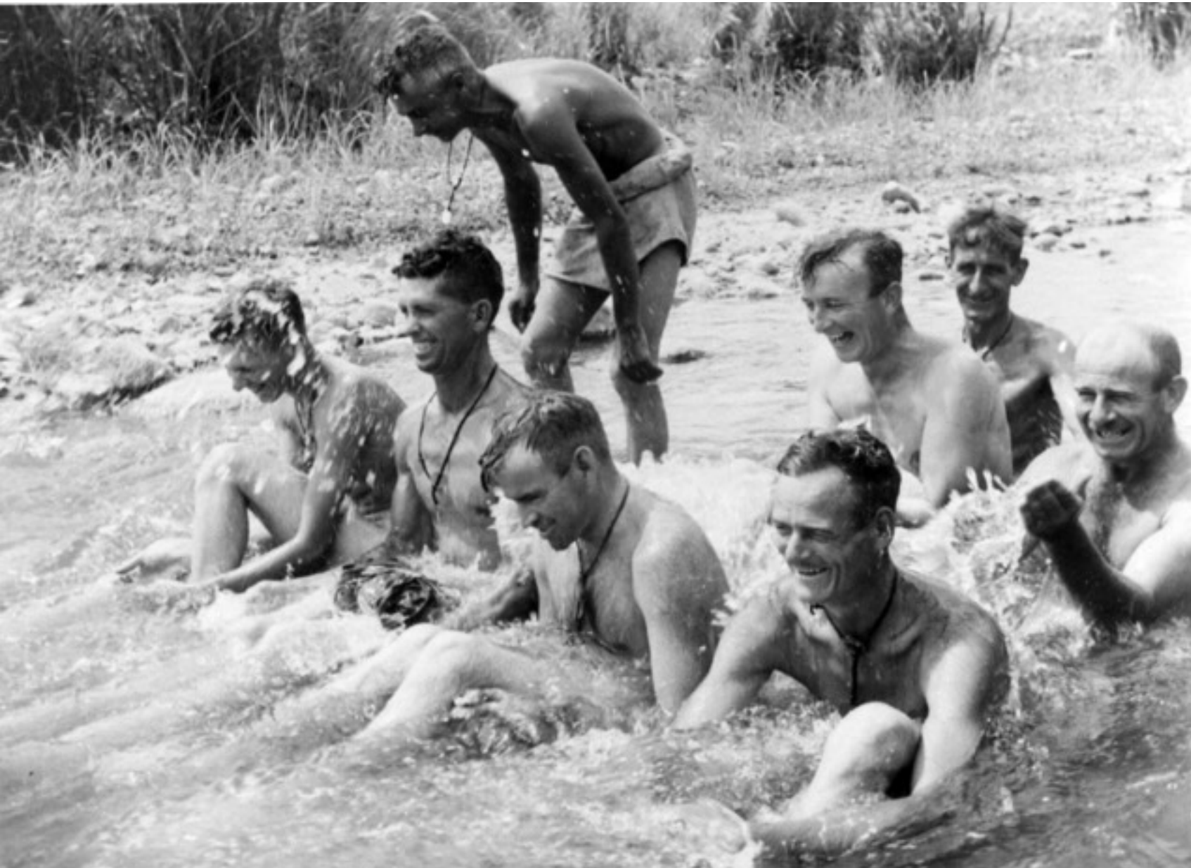
Dumpu, Ramu Valley, New Guinea. Bath time for Australian troops in a creek at Dumpu.