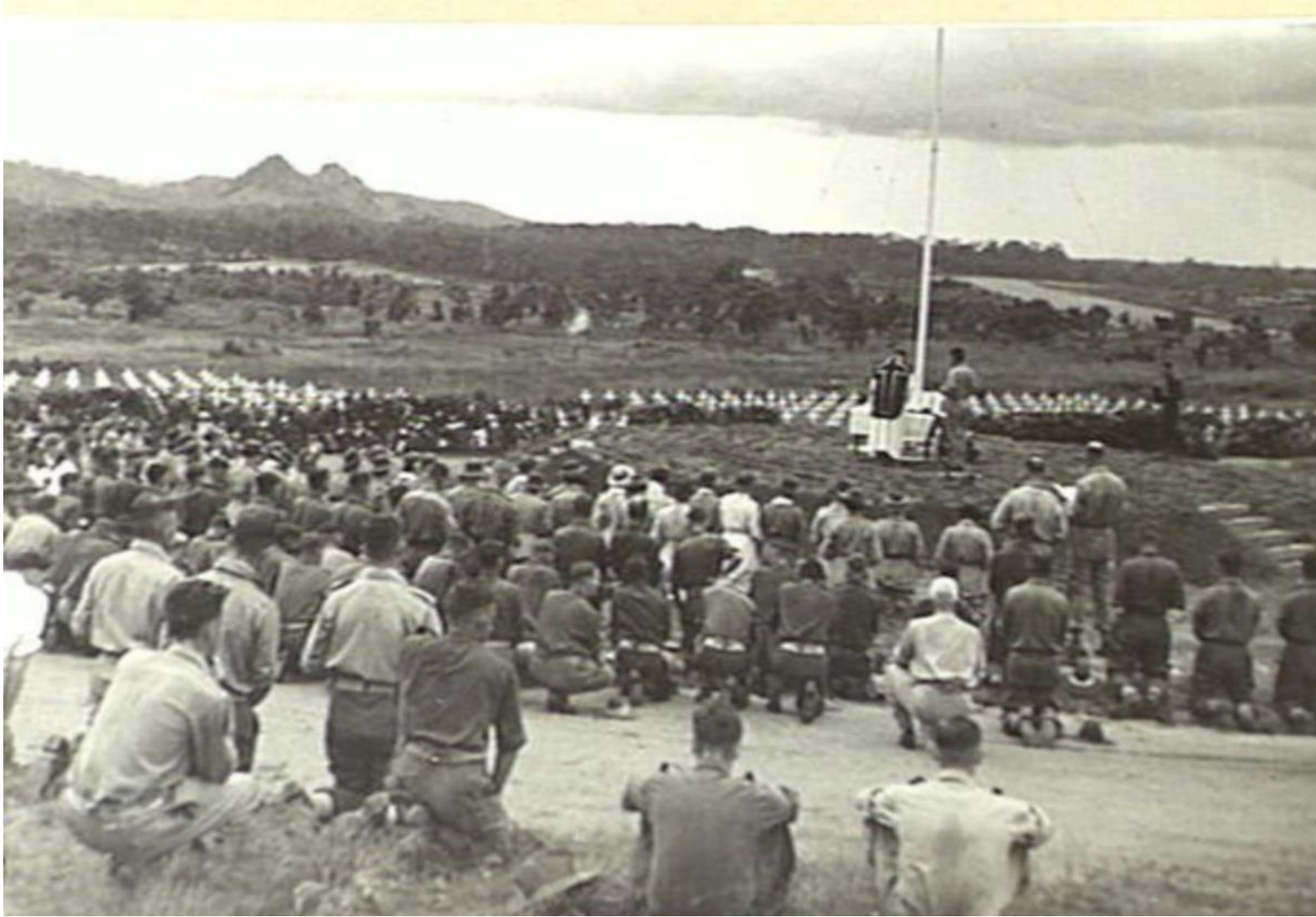
A general view of the congregation attending the requiem mass at the Bomana War cemetery, Port Moresby.