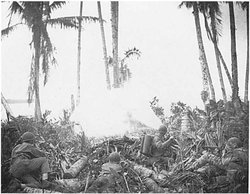
Flamethrowers in action at Munda.

which made the position visible amidst the jungle growth, if not destroying it outright. Next 81-mm. mortars, using heavy shells with delay fuzes, would fire on visible positions. Finally, a platoon or company assaulted, supported by whatever heavy weapons were available. When full reconnaissance was not possible, troops had to attack the terrain—seize and occupy pieces of ground while calling in mortar fire on likely pillbox sites. A tactic of necessity, attacking the terrain could be risky against more than light opposition. The operations officer of the 145th Infantry noted, “Enemy strong points encountered in this fashion often times resulted in hasty withdrawals which were costly both in men and weapons.”