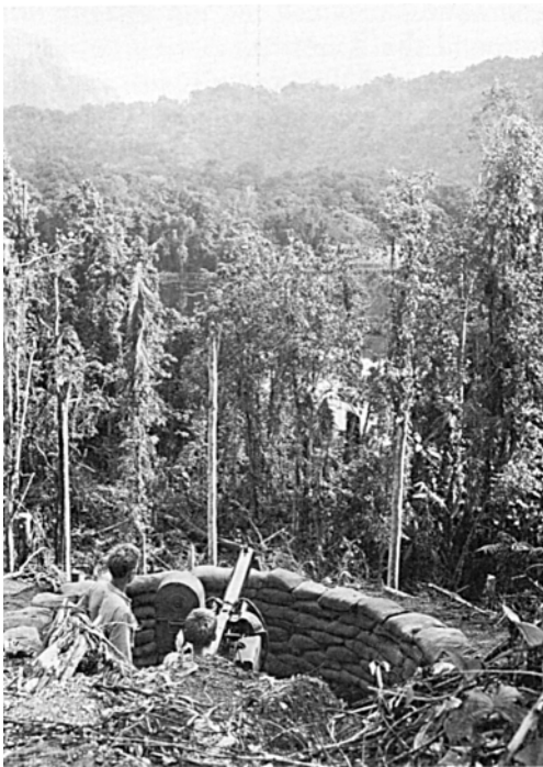
Machine gun crew awaits the Japanese attack on Bougainville.

Hill 700, the first Japanese target, was a commanding position with 65- to 75-degree slopes situated at the eastern end of the 145th Infantry's sector. The sector stretched 3,500 yards west past the southern shore of a lake and ended in low ground near the intersection of a major inland trail with the American perimeter. There, on its left, the 145th tied in with the 129th Infantry.