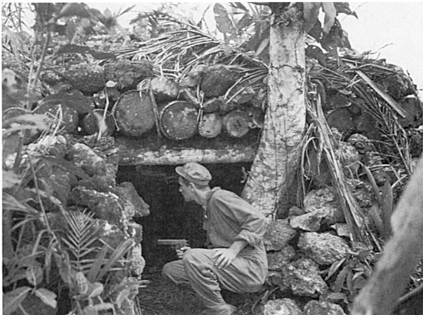
A typical Japanese pillbox.

Most foreboding was information from the 172d Infantry, which, with the support of Marine tanks, had cleared the Laiana beachhead of Japanese during the logistic buildup. These operations revealed the nature of the main Japanese defenses: machine gunners and riflemen ensconced in sturdy pillboxes with interlocking fields of fire. The pillboxes were tough obstacles. Constructed with three or four layers of coconut logs and several feet of coral, they were largely subterranean. The few feet exposed above ground contained machine-gun and rifle firing slits, so well camouflaged that American soldiers often could not determine their location.