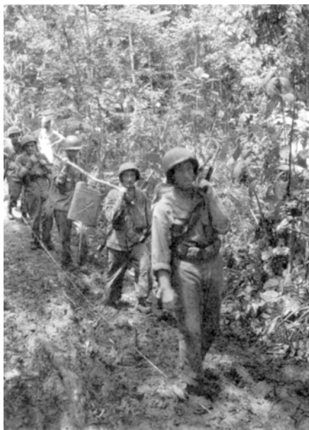
Men of the 148th Infantry carry hot food forward.

Ominously, there now appeared the first large number of shaken, hollow-eyed men suffering from a strange malady, later diagnosed as “combat neuroses.” Before the end of July, the 169th would suffer seven hundred such cases of battle fatigue.