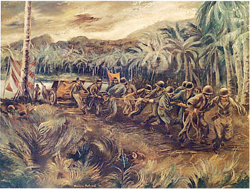
“Landing Artillery at Rendova Island, Solomons Group,” by Aaron Bohrod.

seize Munda, while a supporting force invaded Enogai Inlet, several miles to the north, to cut Japanese communications running from Kolombangara through Enogai to Munda. The seizure of Munda and Enogai would be followed by operations against Vila airfield on Kolombangara and then by operations farther up the Solomons chain.