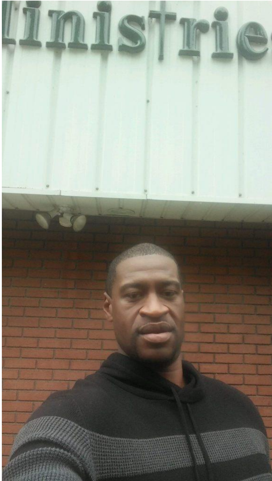
George Floyd Ben Crump Law