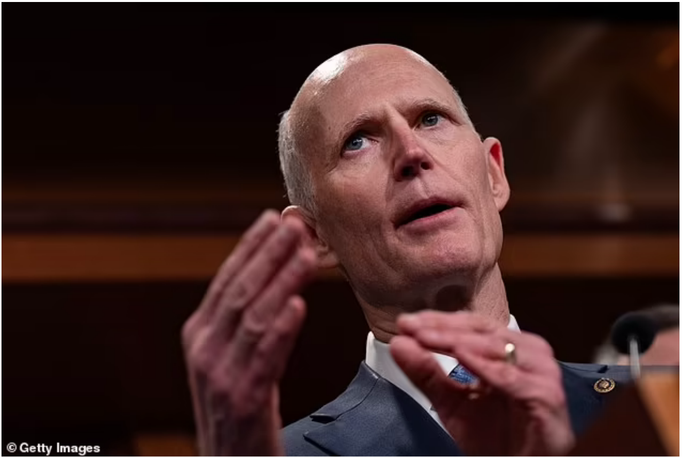
Florida Republican Sen. Rick Scott said that it is time to invoke the 25th Amendment against president Joe Biden