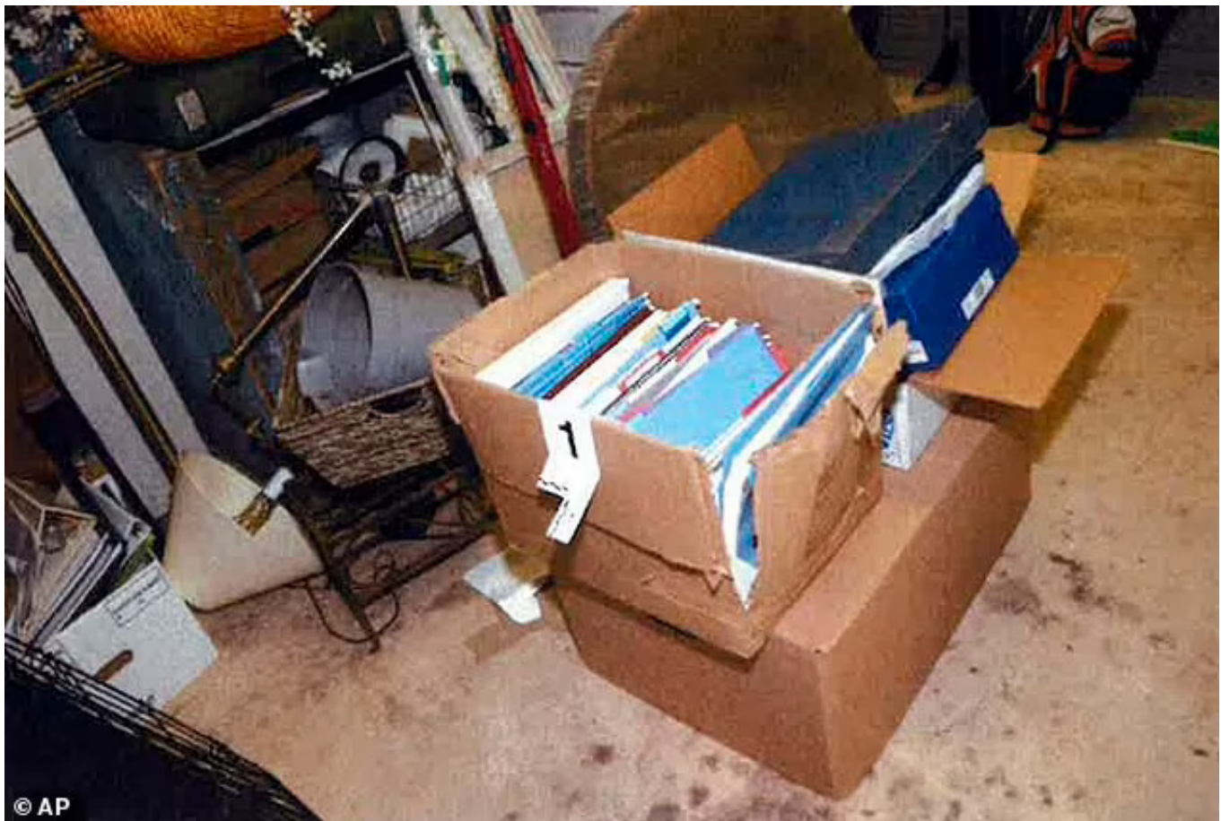
Some of Biden's classified documents were stored the floor of his garage

Rep. Marjorie Taylor Greene , R-Ga., also piled on his call to use the 25th Amendment to remove Biden.