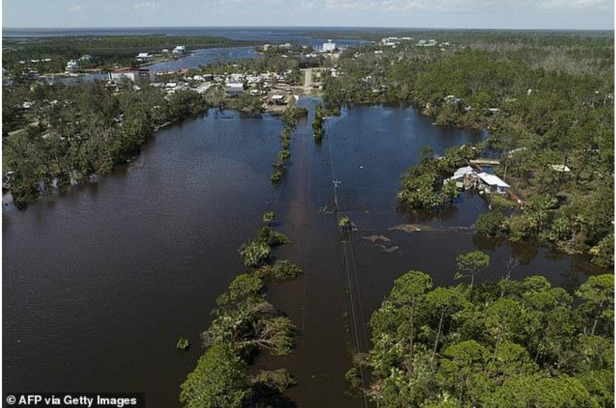
This aerial picture taken on September 27, 2024 shows a flooded street after Hurricane Helene made landfall in Steinatchee, Florida