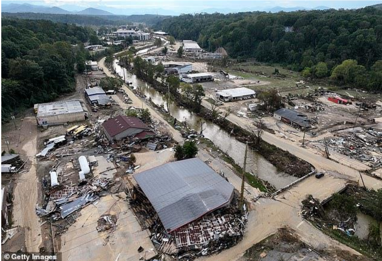
At least 200 people were killed in six states in the wake of the powerful hurricane which made landfall as a Category 4