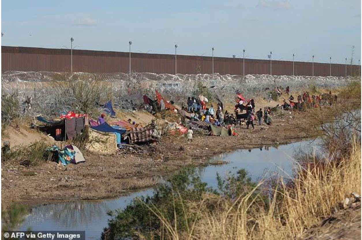
Migrants seeking asylum in the United States wait on the border of Ciudad Juarez, Chihuahua state, Mexico on March 19, 2024