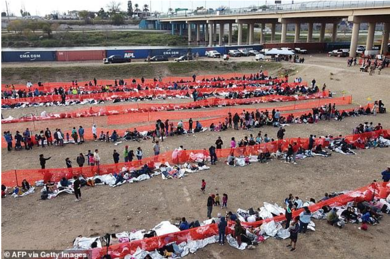
Immigrants wait to be processed at a US Border Patrol transit center after they crossed the border from Mexico in Eagle Pass, Texas on December 20, 2023

'Of FEMA's total budget for FY 2024, what portion of funds can be guaranteed to have been spent solely on American citizens, and what portion of funds was or may have been spent on noncitizens?' Gaetz asks.