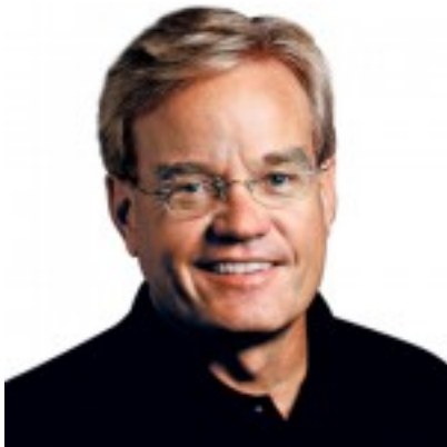
Willow Creek Senior Pastor Bill Hybels

"Willowcreek Community Church in South Barrington, Illinois, outside Chicago, has become the nation's largest church. . . Bill Hybels, in his early twenties when he founded the church, chose the community because it had relatively few churchgoers, though the population was growing fast and churches were plentiful. He went from door to door asking 'Why don't you go to church?' Then he designed a church to answer the potential customers' needs: for instance it offers full services on Wednesday evenings because many working parents need Sunday to spend with their children." 8