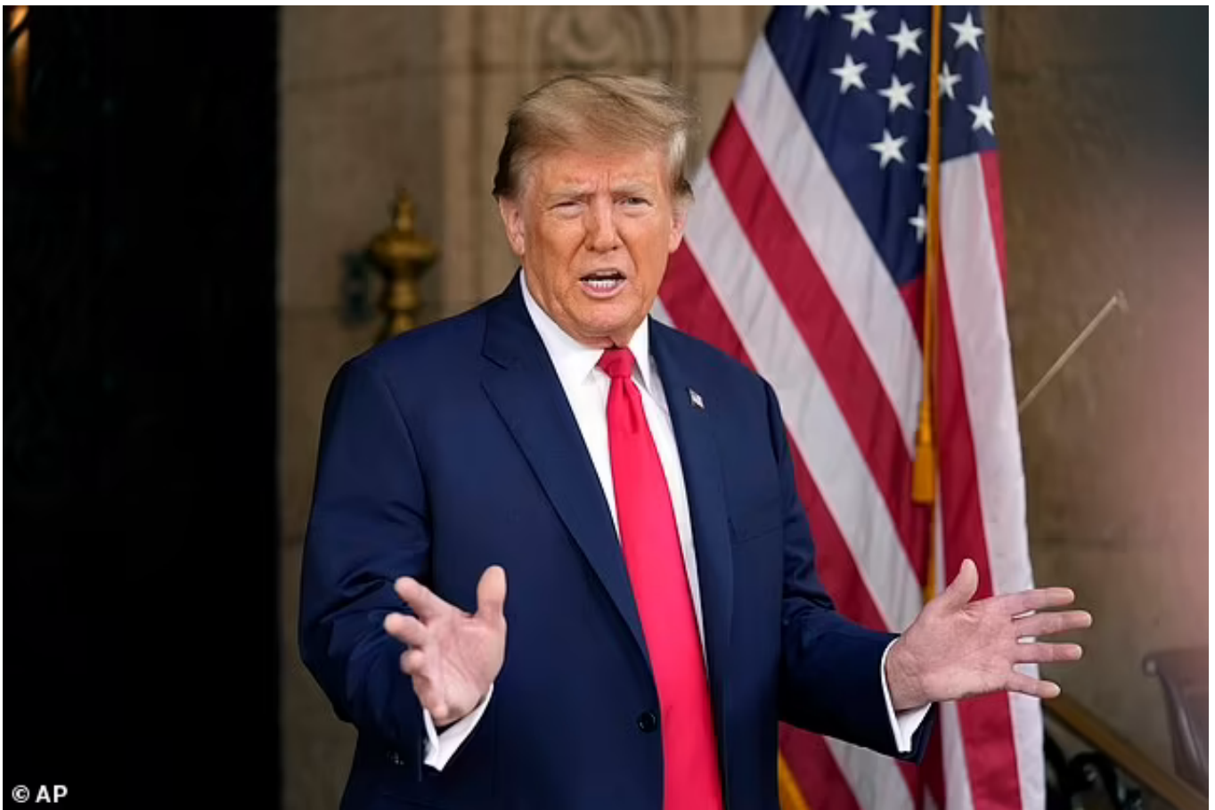
Former President and Republican presidential frontrunner Donald Trump is blasting the Justice Department after declining to prosecute Joe Biden for mishandling classified documents