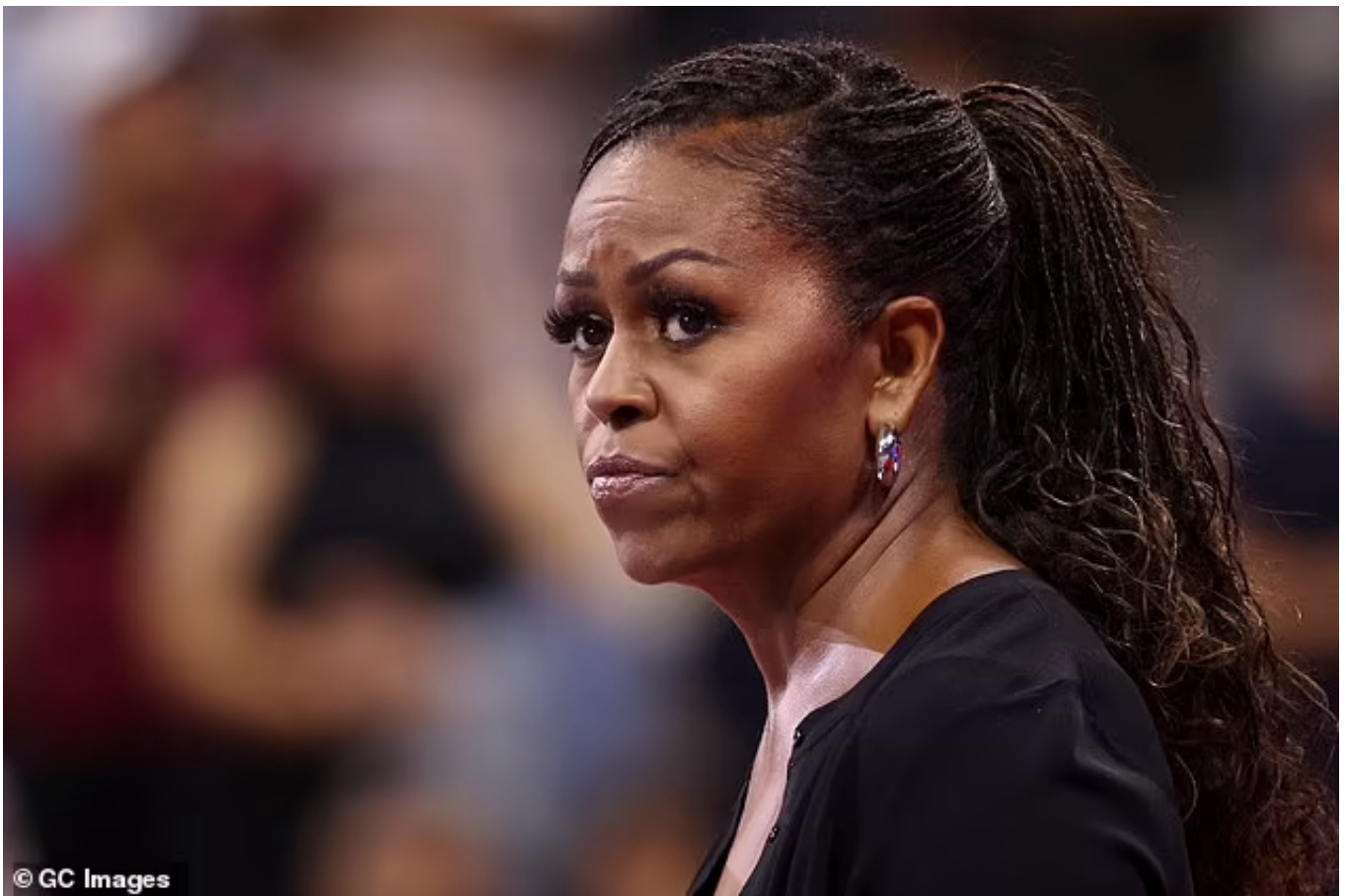
Many Democrats want former first lady Michelle Obama to replace Joe Biden as the 2024 Democrat nominee