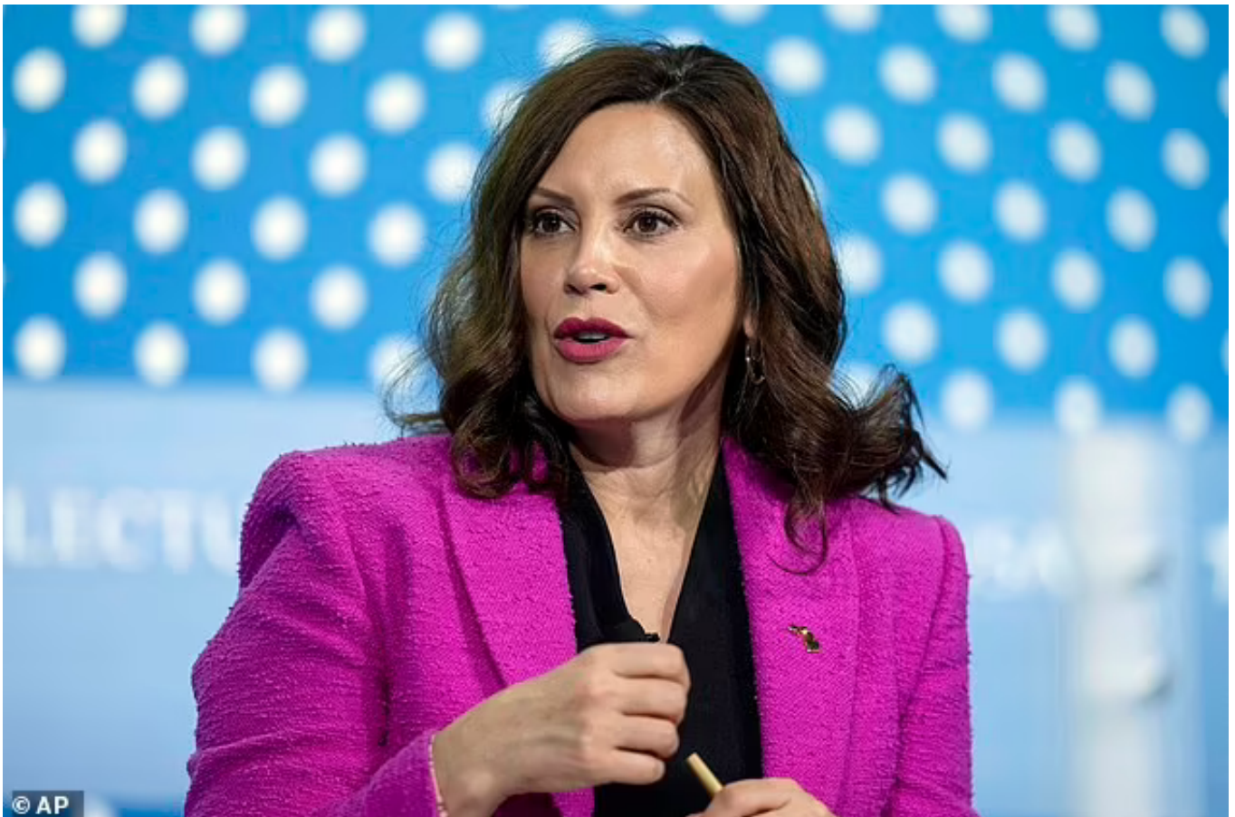
Michigan Gov. Gretchen Whitmer, who Biden considered as a potential running mate, speaks at the SelectUSA