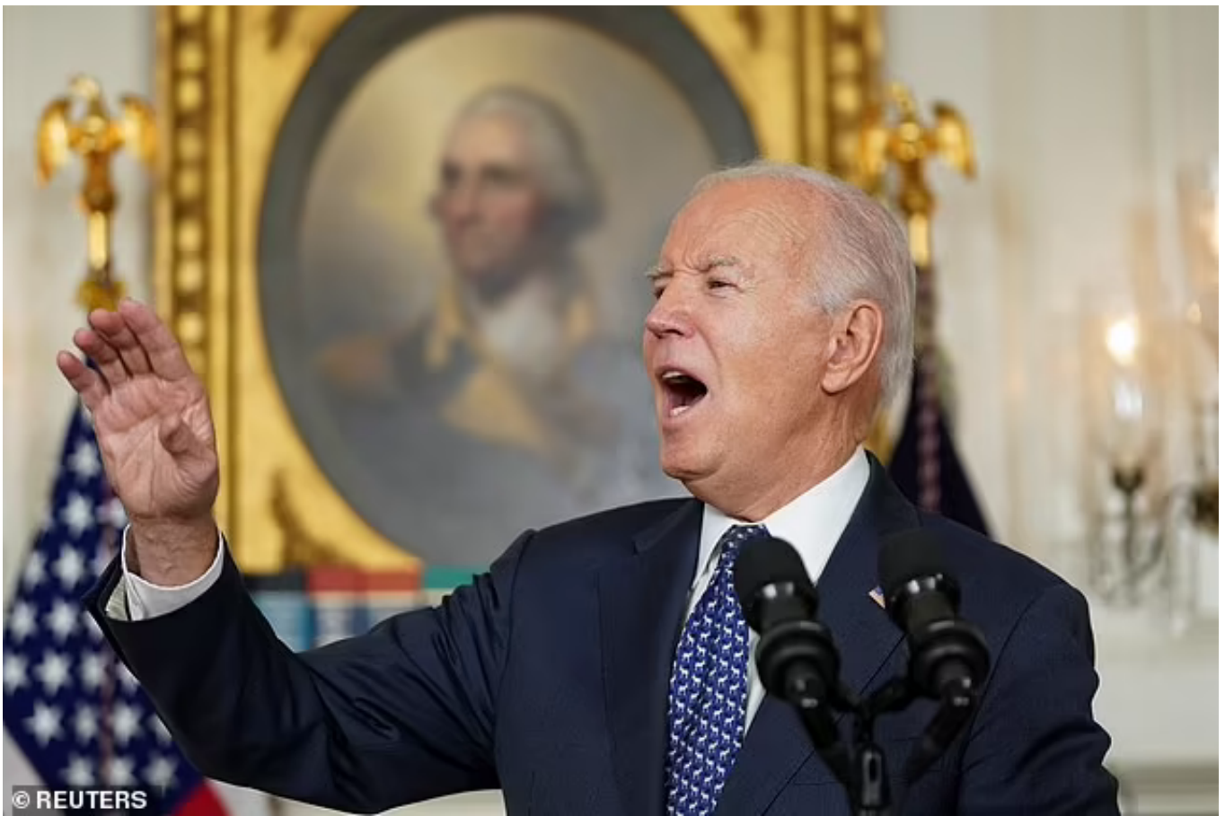
U.S. President Joe Biden reacts angrily as he answers questions about a Justice Department report into his handling of classified documents