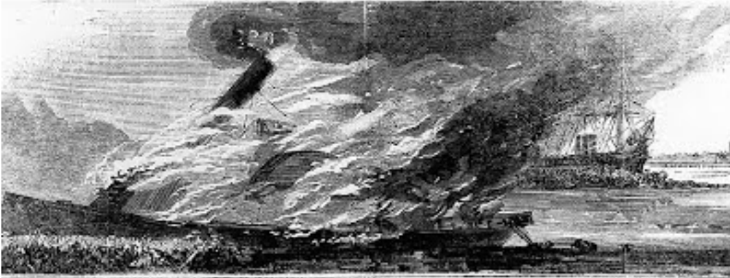
BURNING OF THE REBEL RAM "WEBB" BELOW NEW ORLEANS, APRIL 24, 1865. —[SEE PAGE 207.]