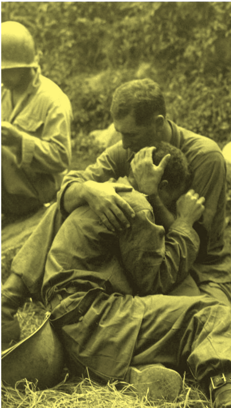
Haktong-Ni area, Korea, August, 1950.

Sanctorum Communio . Lastly, warriors suffering from spiritual injury are often almost devoid of any meaningful social connections or relationships with others. Dietrich Bonhoeffer wrote extensively of the nature of God's people as "the community of saints." 14 Later, he would express the same thought more relative to the decisive presence of Jesus Christ when he termed the Church as "the community