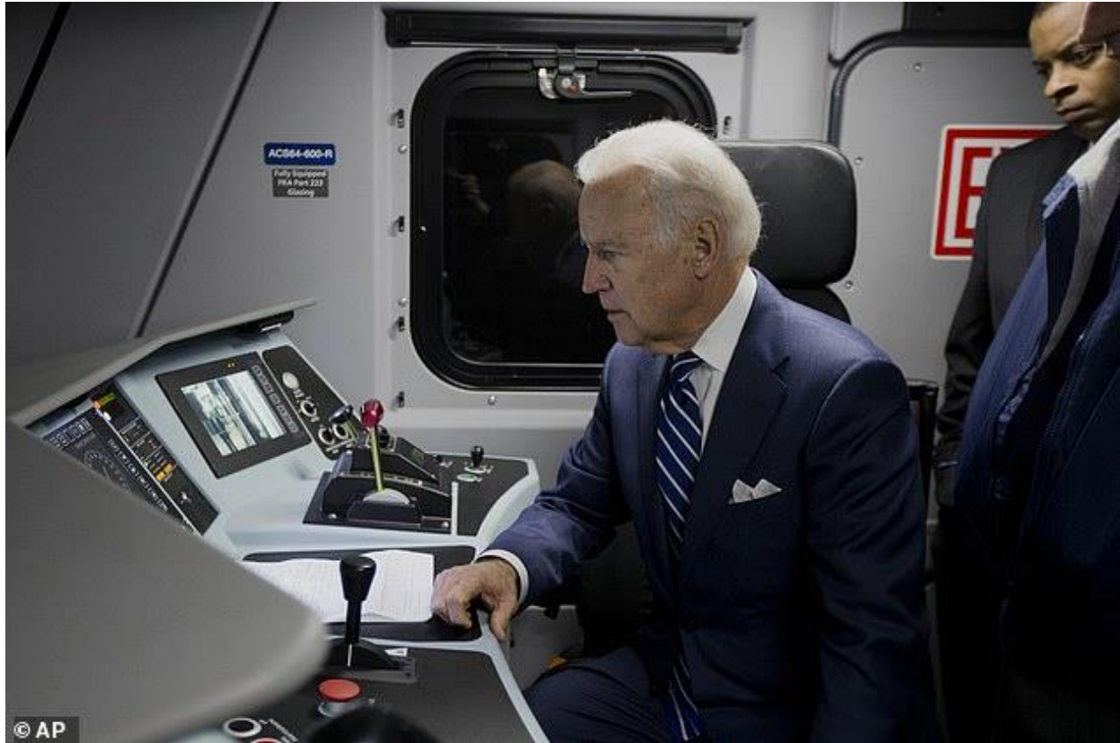
Biden is seen touring an Amtrak train in 2014. He recalled an incident that occurred around 2014 or 2015, but the conductor he named retired in 1993