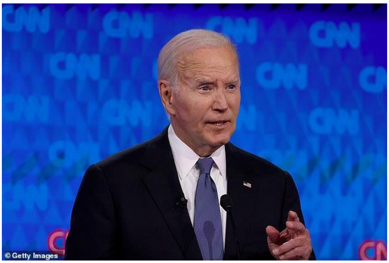
The talking heads all mournfully agreed that now may be time to accept what the rest of the world has understood for some time: Joe Biden is not fit to be a presidential candidate in 2024